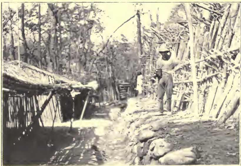
CAPTAIN BALDERSTON INSIDE THE STOCKADE.